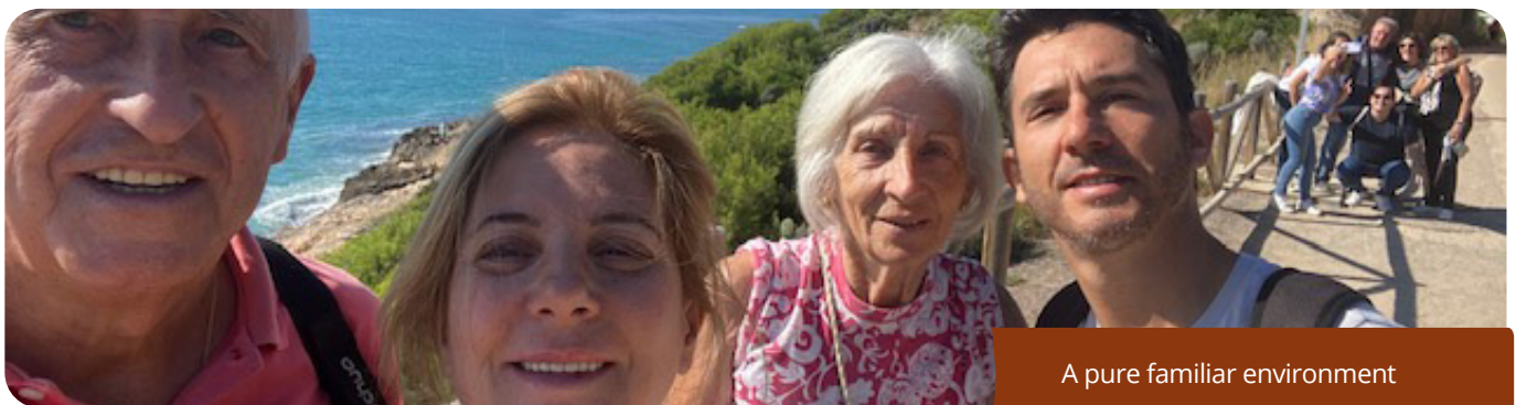
A pure familiar environment

Feel free to suggest any activities that you would like to do!